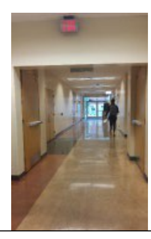
Proceed straight down the hall past the vending machines, Einstein Bros. Bagels, and through the wooden double doors.