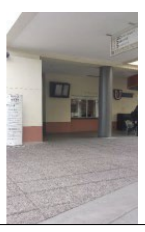
From the roundabout, enter through the double doors to the left of the Information window.