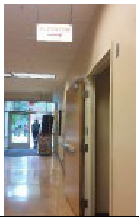
Make a right at the elevator sign. Take this elevator to the 3^{rd} floor.