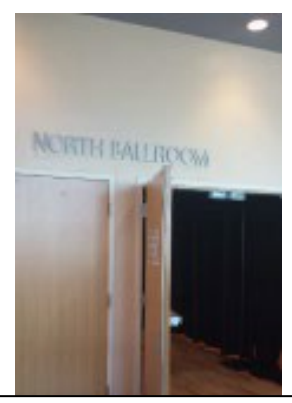
The Ballroom will be on your left.