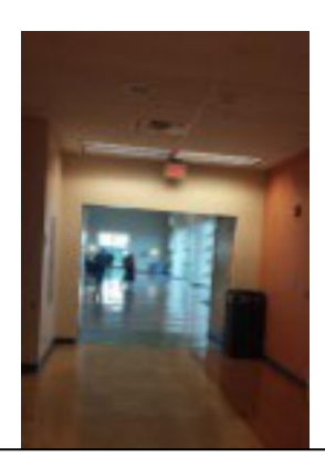
Make a left from the elevator and continue past the Union Gallery and through the indoors exit sign.