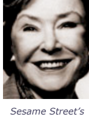
Sesame Street's founder is a UA College of Education graduate

Just about everyone knows Big Bird, Elmo, and the Cookie Monster. In fact, to many people, these Sesame Street characters feel like family. Because of Sesame Street's worldwide reach — it's shown in more than 120 countries! — the program is considered the world's largest educator. What you may not know is that the creator of Sesame Street, Joan Ganz Cooney, is a UA College of Education graduate. After graduating from the University of Arizona in 1951 with a degree in elementary education, she worked as a newspaper reporter. In 1954, she moved to New York City to write for television. Ten years later, she received a local Emmy Award for her study of the anti-poverty program in New York. She then embarked on one of the most significant projects of the late 20th century. After studying the use of television for preschool education and successfully soliciting more than $8 million in funding from foundations and federal agencies, Joan Ganz Cooney founded the Children's Television Workshop and created Sesame Street.